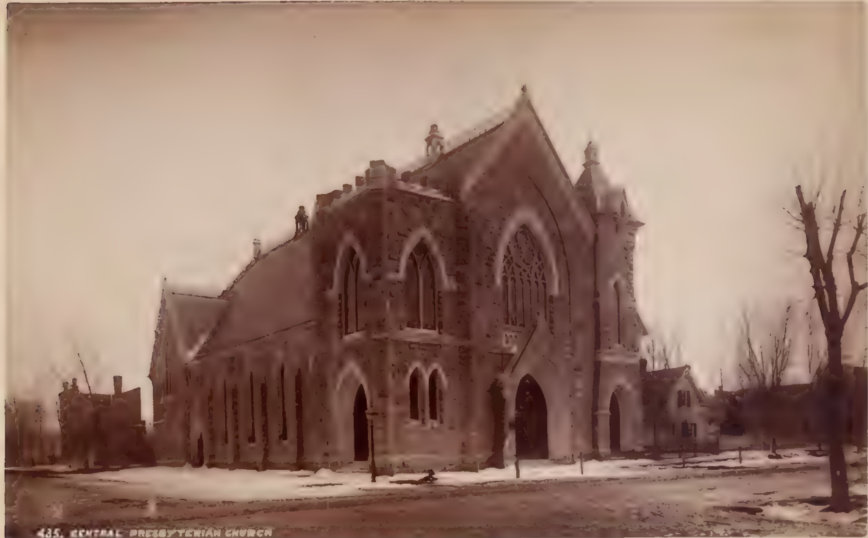
435. CENTRAL PRESBYTERIAN CHURCH